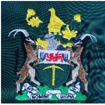
Rhodesian Coat of Arms: For Blazer