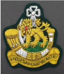
Rhodesian Light Infantry bullion wire: For blazer