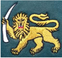
Lion and Tusk: For cap and beanie, as a sew on with green or black backing and for shirts