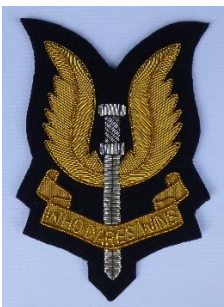
Special Air Service bullion wire: For blazer