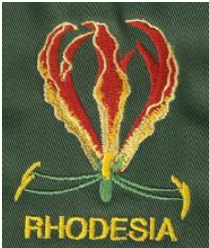
Flame Lily: Available with/without RHODESIA for cap and beanie, as a sew on and for shirts