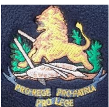
British South Africa Police: For blazer, cap, beanie, as a sew on badge and on shirts