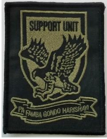
BSAP Support Unit: For blazer and as a sew on badge on black backing