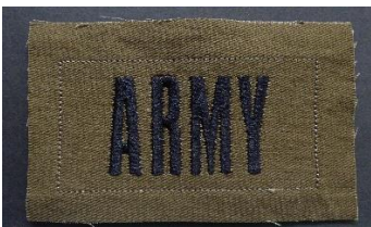
Copy Rhodesian Army Chest Title