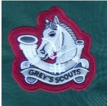
Grey's Scouts: For Blazer