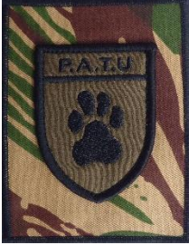
BSAP PATU on camo: 125mm x 95mm as a sew on badge or for blazer