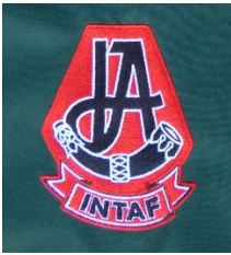
Intaf: For Blazer