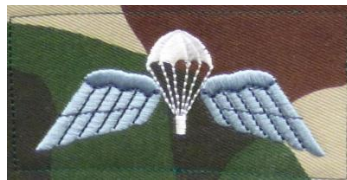
Copy Rhodesian Para Wings: On green or camo backing