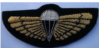
Copy of Rhodesian SAS No 1 dress wings in bullion wire: measure 75mm x