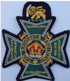
Rhodesia Regiment bullion wire: For blazer