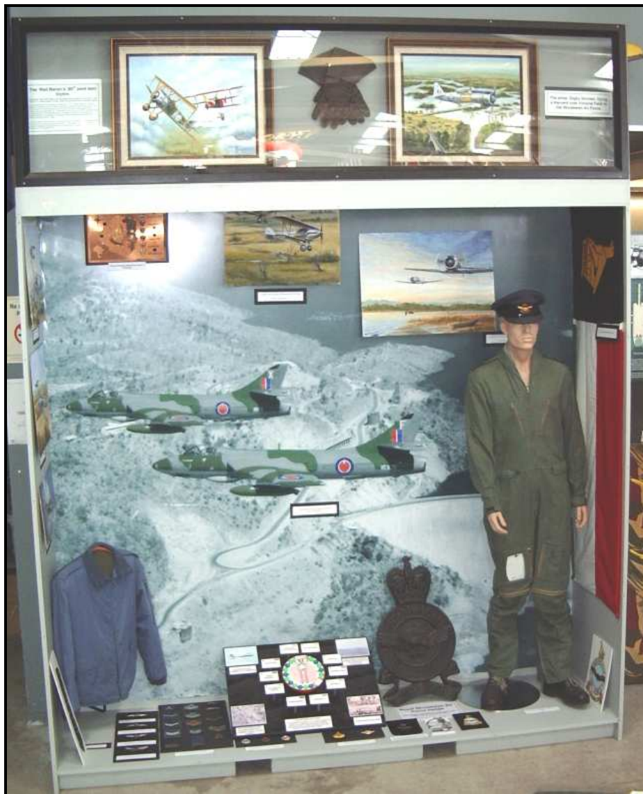
Revamped display cabinet featuring new items and donors listed below Left – Right:

Various Rhodesian pilot's wings – Steve Kesby