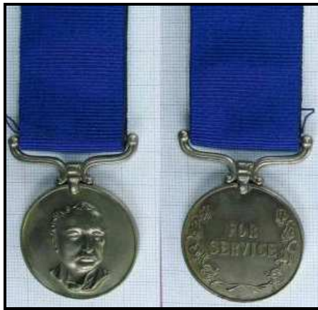
Rhodesian District Service Medal