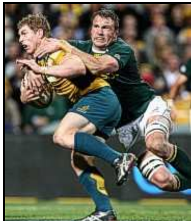
David Pocock gets tackled