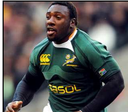
Tendai Mtawarira 'The Beast'