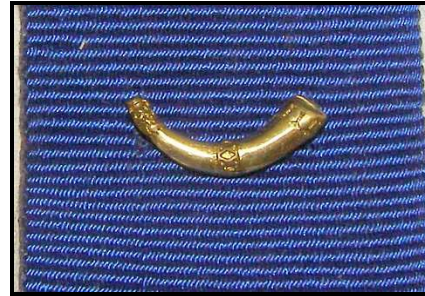
'Oliphant' device on ribbon

The Rhodesian District Service Medal (DSM) was only awarded to black District Assistants and District Security Assistants. No white member of the Rhodesian Security Forces should have been awarded one unless by complete accident. The criteria for being awarded this medal was exactly the same as for the Rhodesian General Service Medal (RGSM) i.e.: For service on operations undertaken for the purposes of combating terrorist or enemy incursions into Rhodesia.